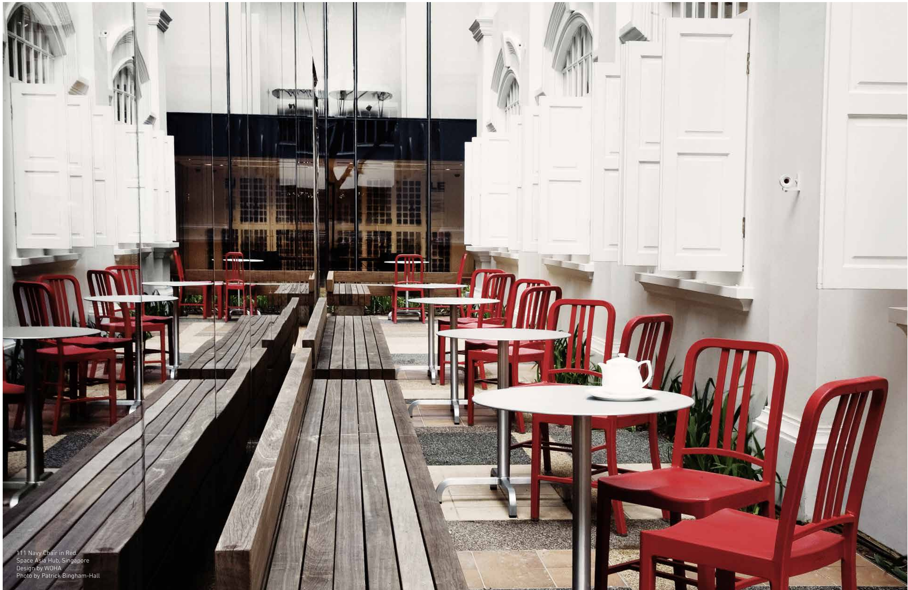
111 Navy Chair in Red. Space Asia Hub, Singapore Design by WOHA