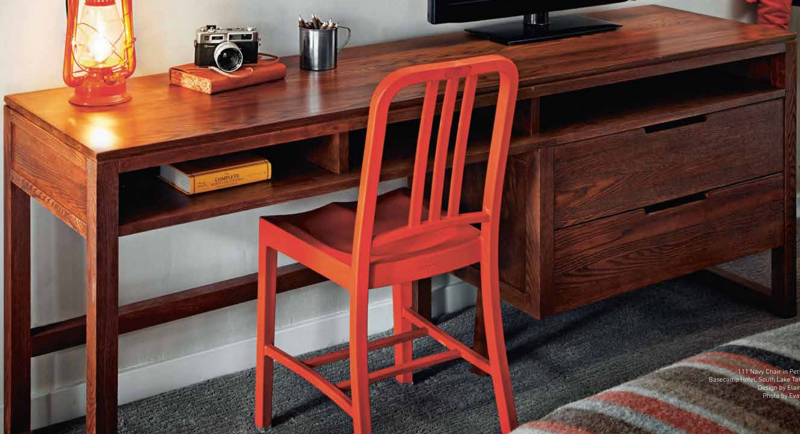
111 Navy Chair in Persimmon. Basecamp Hotel, South Lake Tahoe, USA Design by Elaine Cotter